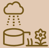
Rain water Harvesting