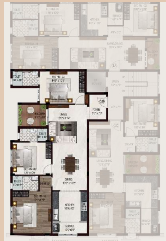
TULSI FLAT - 1B & 2B